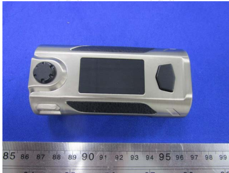
Rudder Box Mod