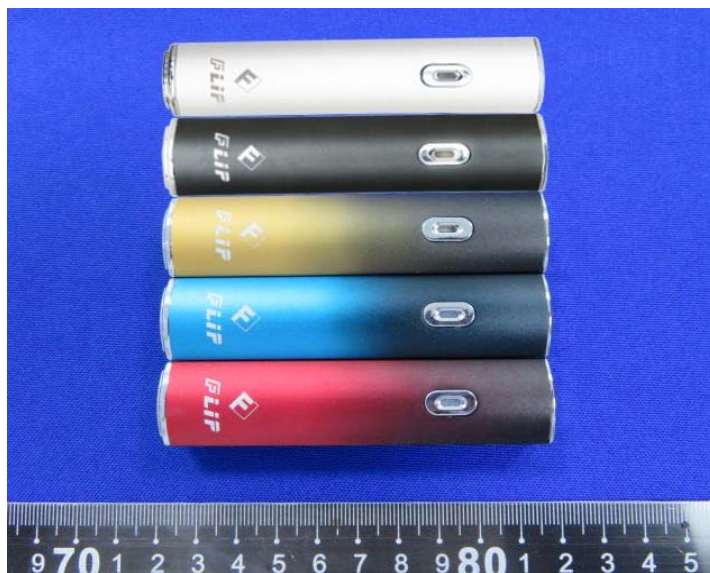
Flip Battery Mod