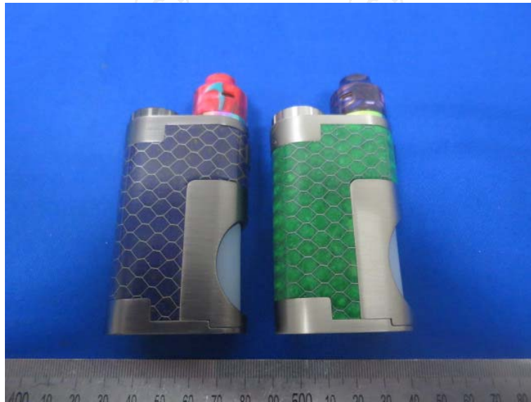
Wasp nano squonk kit